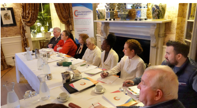
Attendees from Laois PPN, Offaly PPN, & Westmeath PPN

Each PPN gave a presentation on their chosen topic. Laois PPN's topic was on our Climate Action Project for 2023.