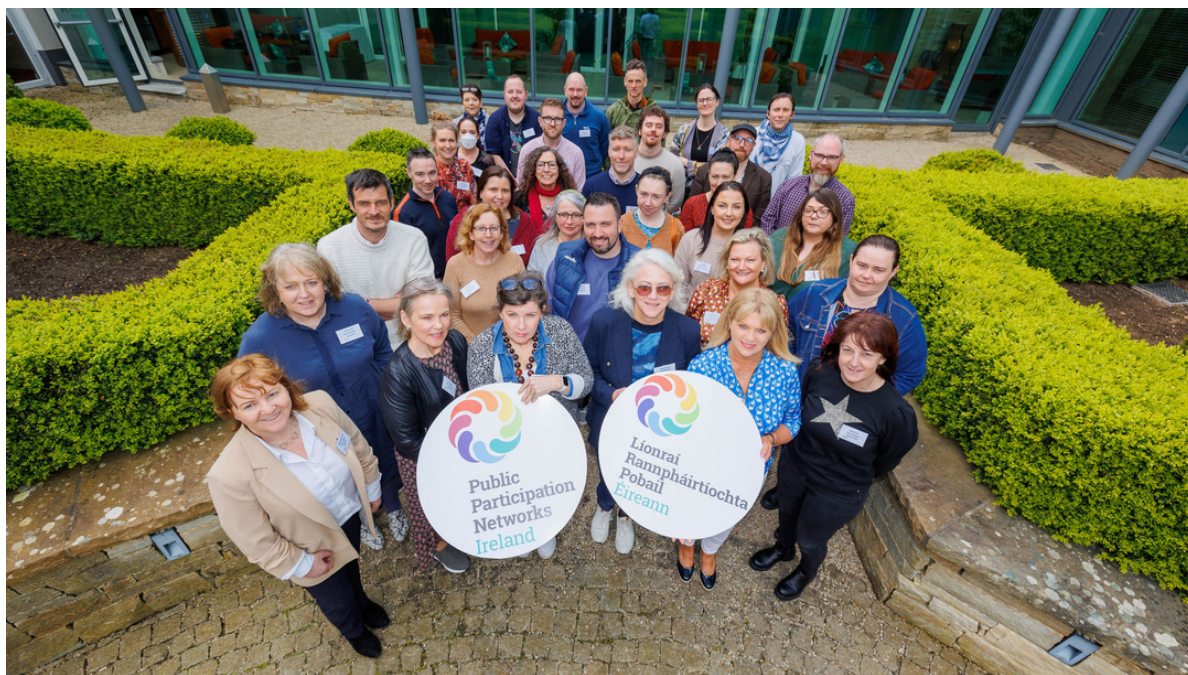
Representatives from the 31 PPNs across Ireland

On the 27th and 28th of April, Laois PPN joined Resource and Support Workers from PPNs across Ireland at the Hodson Bay in Athlone for the PPN Worker's Retreat. The 31 PPNs across Ireland represent 18,000 groups nationally.