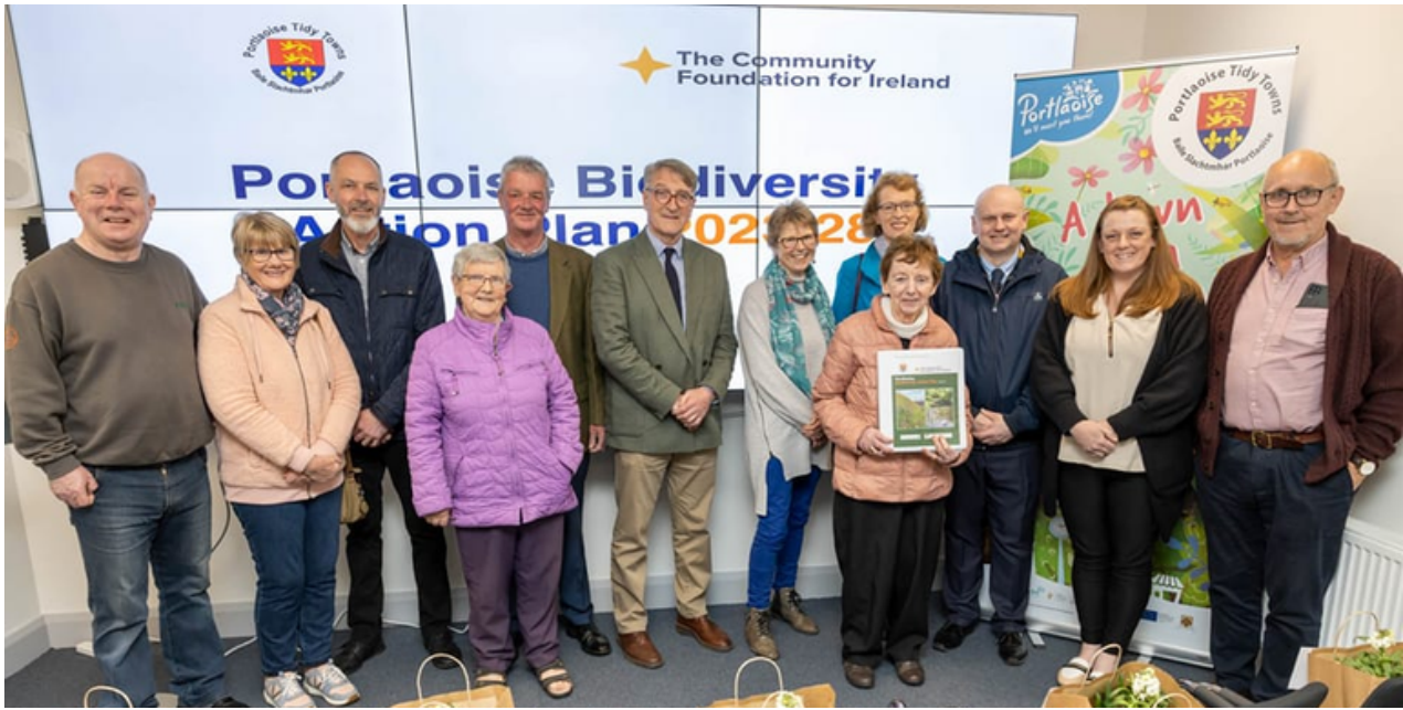
Portlaoise Tidy Towns Members

On Thursday 27th April, Portlaoise Tidy Towns launched their Portlaoise Biodiversity Action Plan 2023-2028 at The Cube, in Portlaoise.