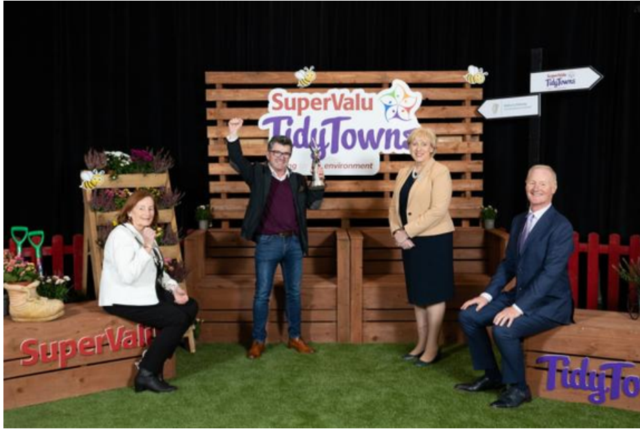
Abbeyleix Tidy Towns celebrating their win for Tidiest Small Town at the 2021 Tidy Towns Awards

Laois PPN would like to remind all Tidy Towns groups across Laois that the Tidy Town Awards applications are closing on Wednesday 10th May.