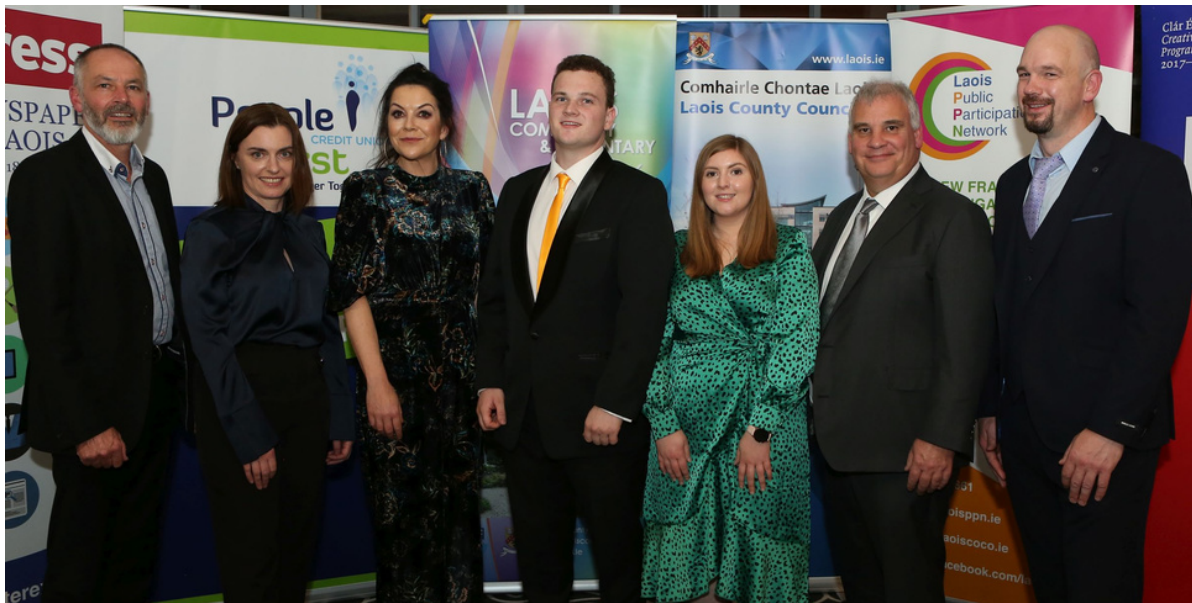
Laois PPN at the 2022 Community & Voluntary Awards Ceremony